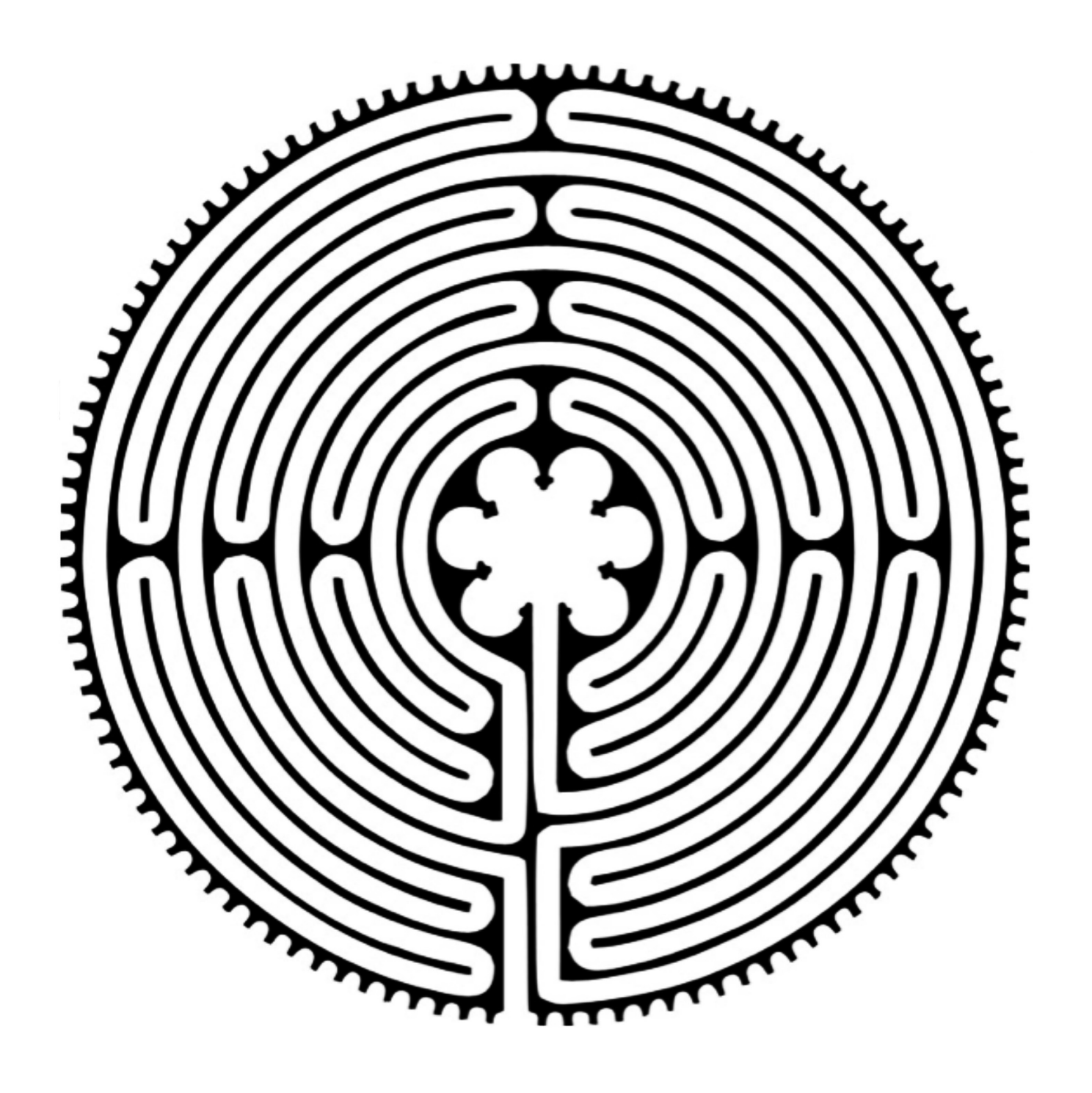
Session 4: Finger Labyrinth