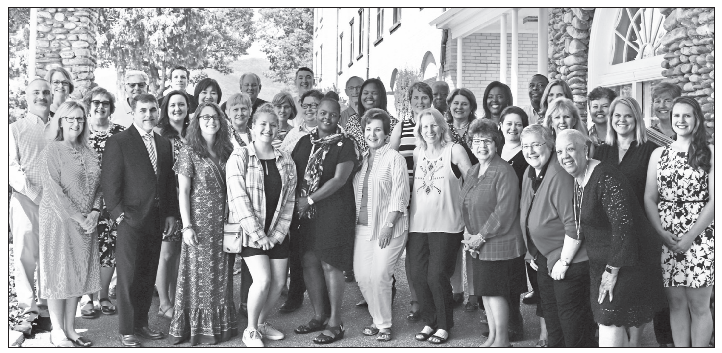
For a list of elected delegates, see Minutes, Section IV.C. of Journal