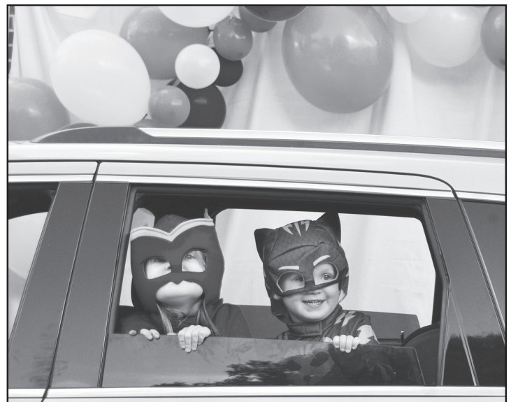
Sedgefield UMC, Charlotte - Drive-Thru Fall CARnival Photo Booth