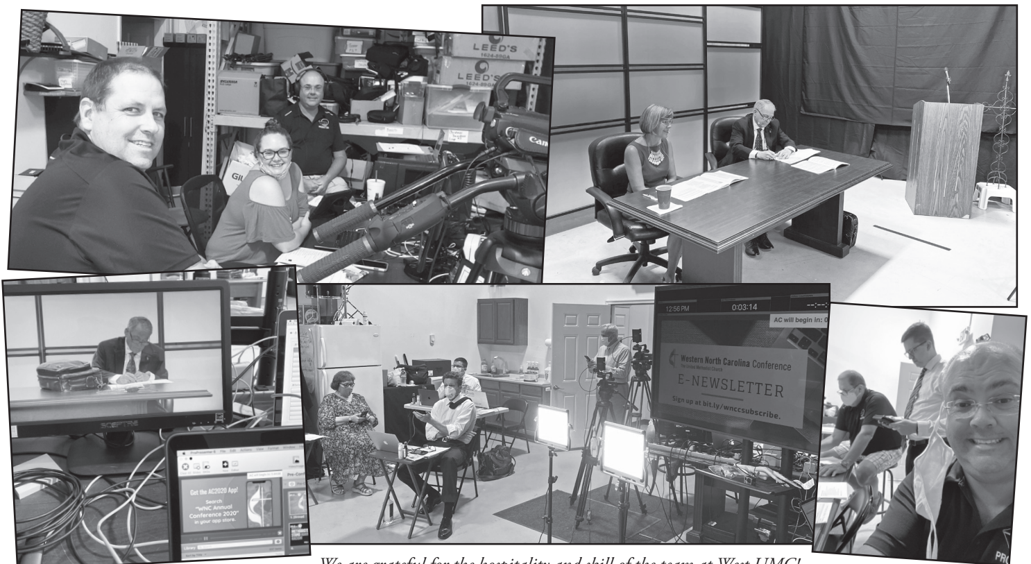
We are grateful for the hospitality and skill of the team at West UMC!

A final version of the 2020 BAC can be found in Section V of this Journal.